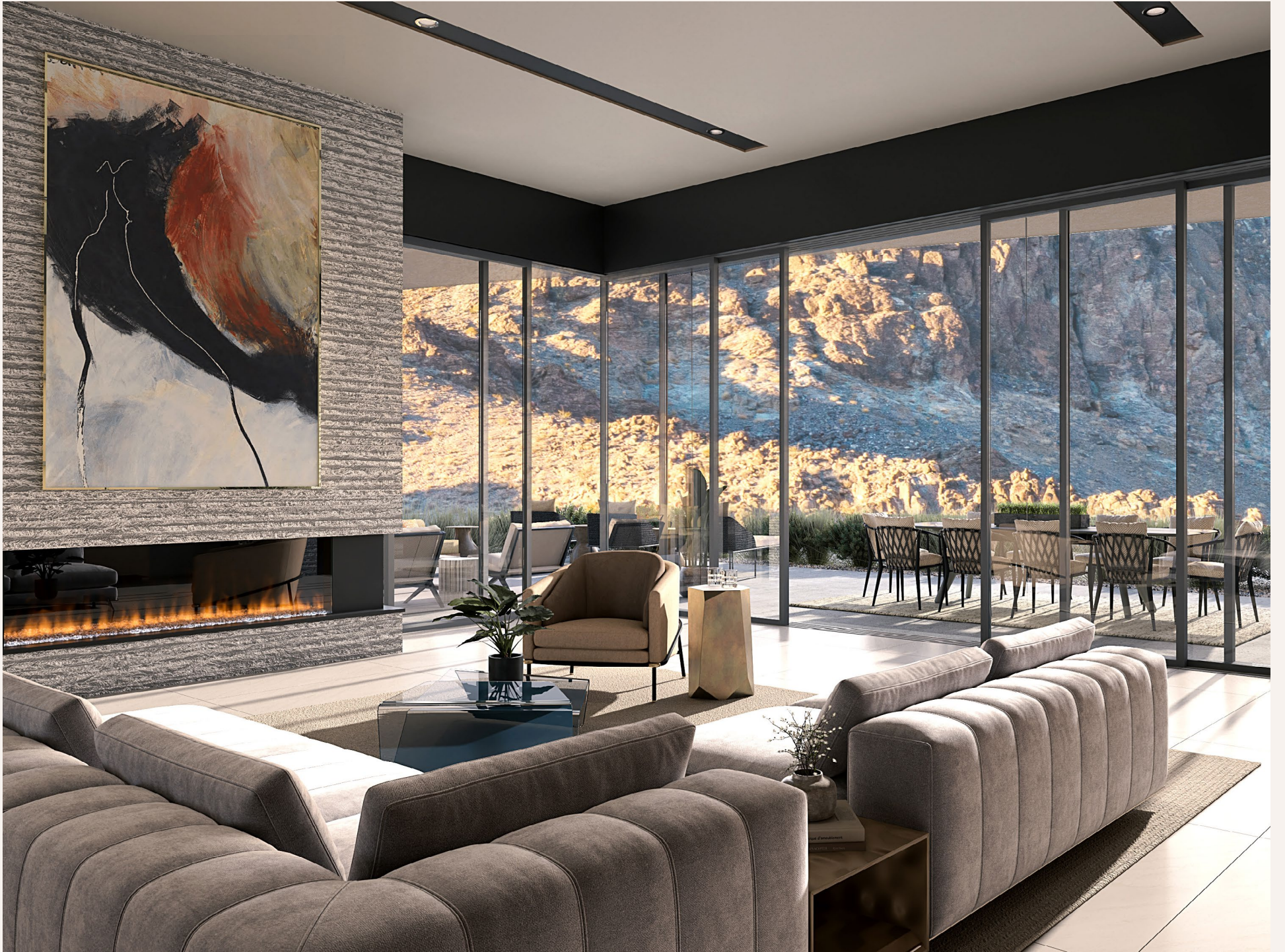
THE CANYON AT ASCAYA